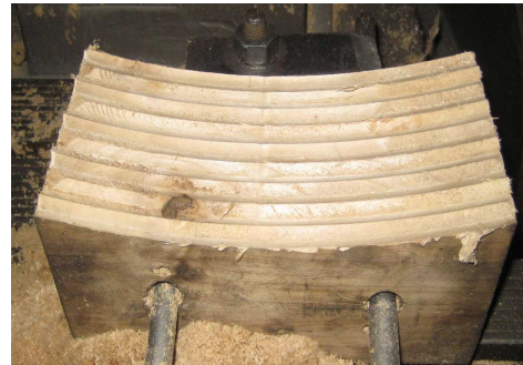
Fig. 4. Smooth cutting path

To demonstrate the dangerous error of the real cutting passes when the tool cuts through the singularities, the old postprocessor is employed to generate the G-codes, based on the CL data yielded. As a result, the machined surface is damaged as shown in Fig. 3 since the tool always turn back approximately 180° when the cutter cuts near the middle of each cutting curve (the singular point). In case of using the improved postprocessor, the cutter moves smoothly on the planned passes. The real cutting path is shown in Fig. 4.