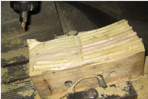
Fig. 3. Real cutting path with dangerous error