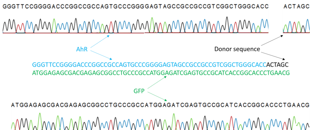
Figure 2. Sanger sequencing confirmation of the integration of the GFP-Puro cassette in the AhR-KO cell clone.