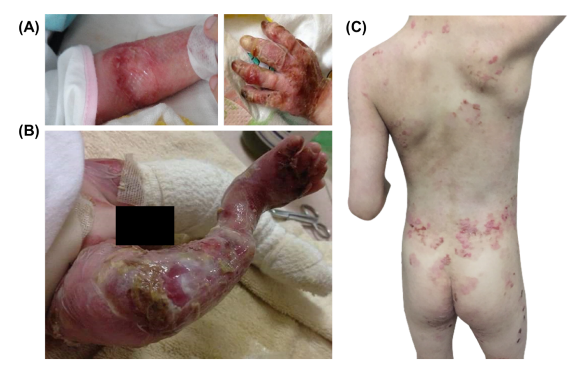
Figure 1. Clinical features of Vietnamese EBS patient. Infant presented with generalized bullae, erosions in arms (A) and the peeling skin in legs (B). The improvement with age was observed and patient presented with fewer and milder lesions (C).

nonconsanguineous Vietnam parents, recruited from Vietnam Military Medical University. Written informed consent was obtained from all family members before sample collection. This study was approved by the Institute of Genome Research Institutional Review Board, Vietnam Academy of Science and Technology. The patient's birth weight was 2.9 kg in the full term of gestational age and presented with severe lesions including peeling skin on limbs (Figure 1A and 1B) and widespread blisters, erosions in the body. In 14 days after birth, the level of lesions increased in two legs and signed of necrosis with smelly. However, his lesions gradually improved by taking well care with a bandage, clean properly and skin moisturizing. The syndactyly of fingers was seen and had to bandage for separation. The extent of these lesions improved over time, with primarily involving areas of friction (Figure 1C). The development of nail dystrophy in two index fingers and toes, and moderate palmoplantar keratoderma were observed around 6 years old.