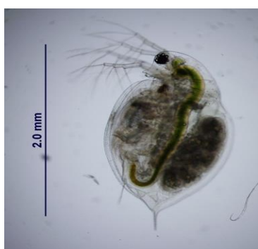
Figure 1. Morphology of Daphnia carinata (adult, female) used in this study.

University – Ho Chi Minh City for over a year. D. carinata were cultured in 1.2 L beakers with 1.0 L of COMBO medium (Kilham et al. , 1998). The light intensity was approximately 1000 lux. The crustaceans were fed with a mixture of green alga ( Chlorella sp.) and YCT (yeast, cerrophyll and trout chow digestion), prepared according to the U.S. Environmental Protection Agency Method (US EPA, 2002) with a modification to the algal culture medium, which was the COMBO medium. Algae Scenedesmus spp. were culture in COMBO medium.