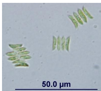
Figure 2. Morphology of colonies of Scenedesmus sp. under a microscope. Scale bar: 20 \mu m.