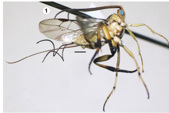
Figure 1. Sulorgilus devriesi Long & van Achterberg, sp. n., holotype, female, habitus, lateral aspect.

times as long as temple (11:5); POL:OD:OOL=6:3:6 (fig. 2); distance between front and hind ocelli:OOL =2:3; in lateral view eye 1.6 times wider than temple (fig. 3); face largely punctate and nearly rugose-punctate; clypeus distinctly punctate; vertex and temple mainly rugose-punctate.