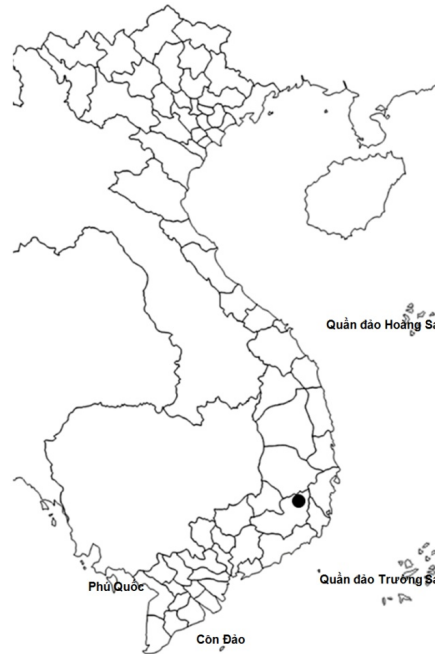
Figure 1. Type locality of Macrosemia lamdongensis sp. n.

and swollen at about posterior 2/3; forewing slender with sharp tip, its length longer than 3.2 \times width. See also Lee & Hayashi (2003) [23].