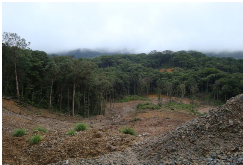
Figure 4. The habitat of Macrosemia lamdongensis sp. nov. the collecting locality