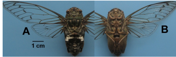
Figure 2. Macrosemia lamdongensis sp. nov. A. Dorsal view of male; B. Ventral view of male.

operculum margin pale yellow-brown except basal part of outer margin black.