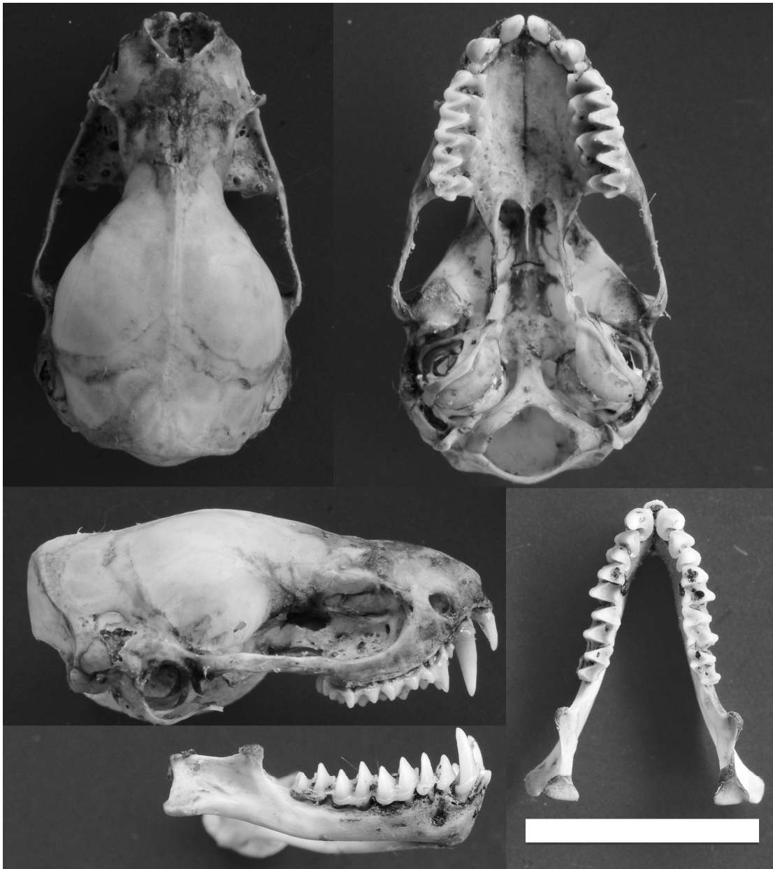
Figure 2. Ventral, dorsal, and lateral (from top-right anticlockwise) views of the skull and mandible of Chaerephon plicatus from Vietnam. Scale = 10 mm.