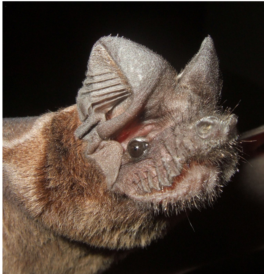
Figure 1. Face and ear of Chaerephon plicatus from Vietnam