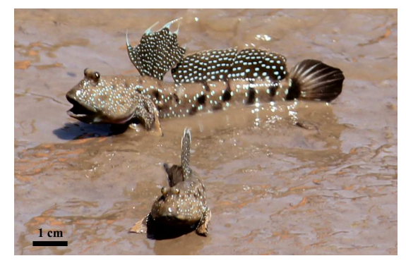
Fig. 1. Boleophthalmus boddarti

The blue-spotted mudskipper Boleophthalmus boddarti (fig. 1) is common one of an amphibious fishes inhabiting in the muddy area of coastlines and estuaries in Soc Trang province, Mekong Delta, Vietnam [7]. This species can use the air surrounding surface of the mudflat for breathing and use burrows as place of living, forging prey and refuge from predators [2, 15]. This species is one potential commercial fish in Mekong Delta [15]. However, there has been little know on this its distribution. species morphology, environmental adaptation [7], distribution [4], geographic burrowing morphology and utilization [2, 15], and diet Meanwhile, relationship reference [16]. between weight and length (WLR), which can serve as an indicator for stock assessment and fishery management [3, 8, 12, 14], of this mudskipper B. boddarti has not known, especially in Mekong Delta where dry and wet seasons are distinctive and fish habitats are severely affected by heavy flooding as a consequence of climate change [11].