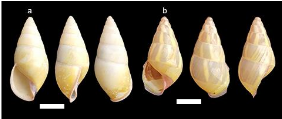
Figure 4. a. Amphidromus smithii , VNMN-IZ 000.002.311; b. Amphidromus zebrinus , HNUE-LS 000.11. Scale 10 mm