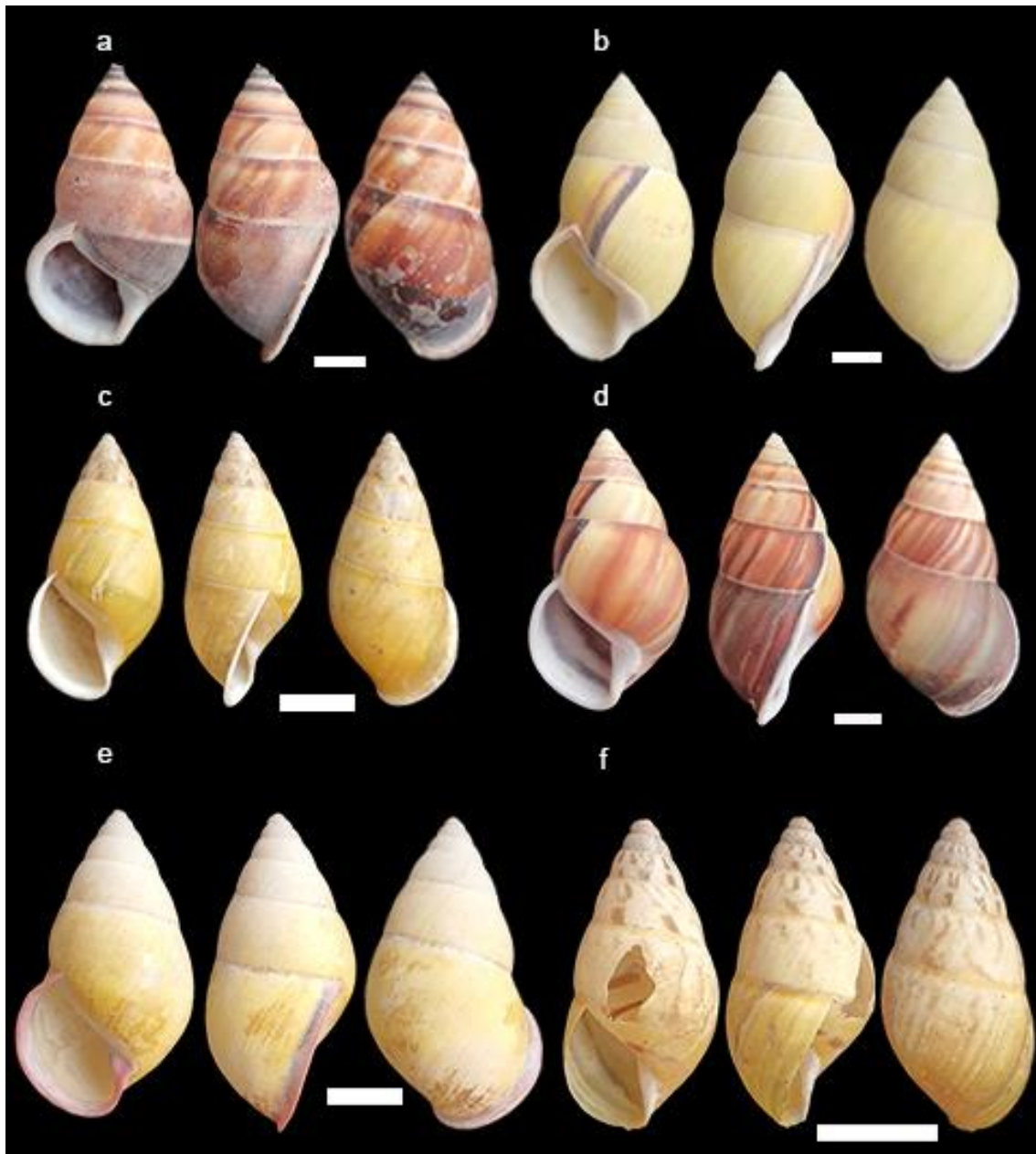
Figure 3. a. Amphidromus inversus annamiticus , CTU-LS 012.01; b. Amphidromus leucoxanthus , CTU-LS 015.02; c. Amphidromus mouhoti , VNMN-IZ 000.002.316; d. Amphidromus perversus natunensis , CTU-LS 015.02; e. Amphidromus roseolabiatus , VNMN-IZ 000.002.314; f. Amphidromus areolatus , HNUE-LS 000.10. Scale 10 mm