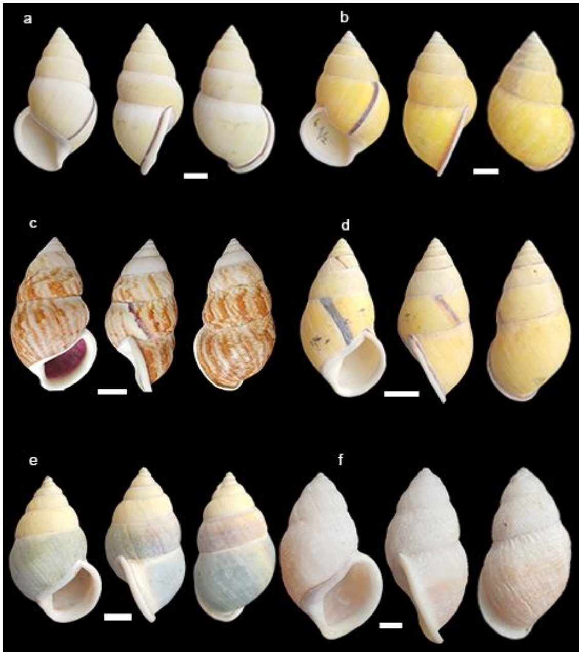
Figure 2. a. Amphidromus atricallosus , CTU-LS 012.09; b. Amphidromus atricallosus perakensis , CTU-LS 015.10; c. Amphidromus cambojiensis , HNUE-LS 000.05; d. Amphidromus cochinchinensis , HNUE-LS 000.08; e. Amphidromus comes , HNUE-LS 000.07; f. Amphidromus ingens , VNMN-IZ 000.002.318. Scale: 10 mm

distinctions, including variations in shell color (including unpolished shades of yellow, brown-purple, and grayish-green), as well as uneven embryonic and post-embryonic whorls in some individuals, resembling malformations.