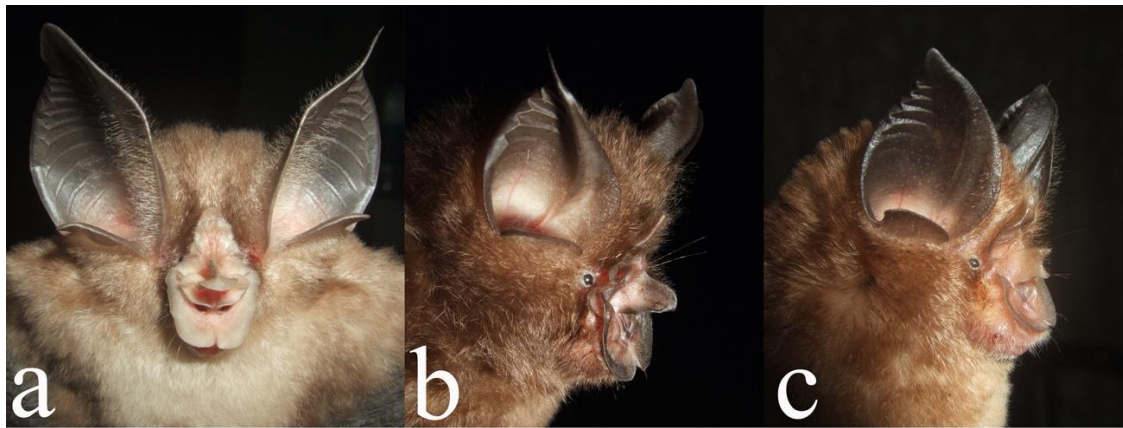
Figure 1. Frontolateral view of horseshoe bat species from mangrove ecosystem of Cat Ba National Park: Rhinolophus marshalli (a), R. pearsonii (b) and R. pusillus (c)