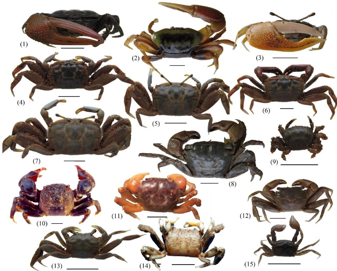
Figure 4. Some Brachyura species in the Tien Hai mangrove forest. (The line below each image is 10 mm). (1) Uca dussumieri ; (2) Uca arcuata ; (3) Uca borealis ; (4) Macrophthalmus definitus ; (5) Macrophthalmus pacificus ; (6) Macrophthalmus sp.; (7) Macrophthalmus tomentosus ; (8) Parasesarma eumolpe ; (9) Leipocten trigranulum ; (10) Neosarmatium smithi ; (11) Sarmatium germaini ; (12) Metaplex longipes ; (13) Metaplex elegans ; (14) Anomalifons lightana ; (15) Ilyoplax ningpoensis

and Metaplex elegans . Among the sampling sites, TH5 is the most abundant in the number of species (Tables 1, 2).