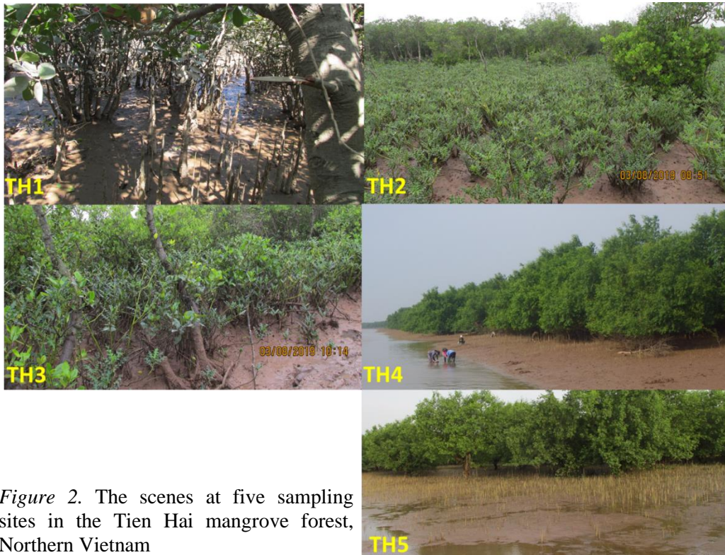
Figure 2. The scenes at five sampling sites in the Tien Hai mangrove forest, Northern Vietnam