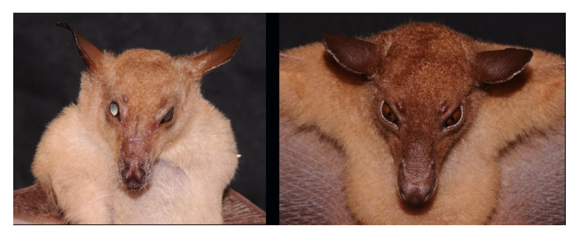
Figure. 1. Frontal view of M. minimus (left) and M. sobrinus (right) from Vietnam (not to scale)

rather short and sharp. Upper tooth rows have two molars, lower tooth rows have three to four molars.