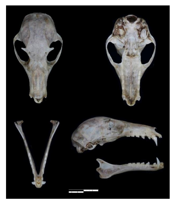
Figure. 2. Dorsal, ventral, and lateral (from top-left clockwise) views of the skull and mandible of M. sobrinus from Vietnam. Scale = 10 mm