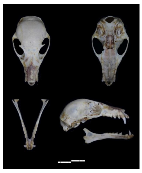
Figure. 3. Dorsal, ventral, and lateral (from top-left clockwise) views of the skull and mandible of M.minimus from Vietnam. Scale = 10 mm

narrow. There are eight palatal ridges on the palatal surface. The mandible is long and thin, with low processes. Symphysis keel of lower jaw is obsolescent. In lateral view, it has a slopping outline (Fig. 3). The upper tooth rows length of an average 8.2 mm (8.0–8.4), the lower tooth rows length of an average 9.4 mm (9.2–9.6) (Table 1). The canines are rather short and sharp. Upper tooth rows have two molars, lower tooth rows have three molars.