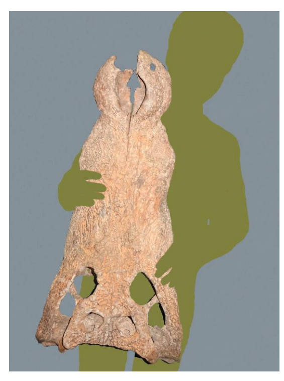
Figure 3. Held by one of the authors (Nguyen Thien Tao), the huge dimension of Dau Sau becomes apparent.