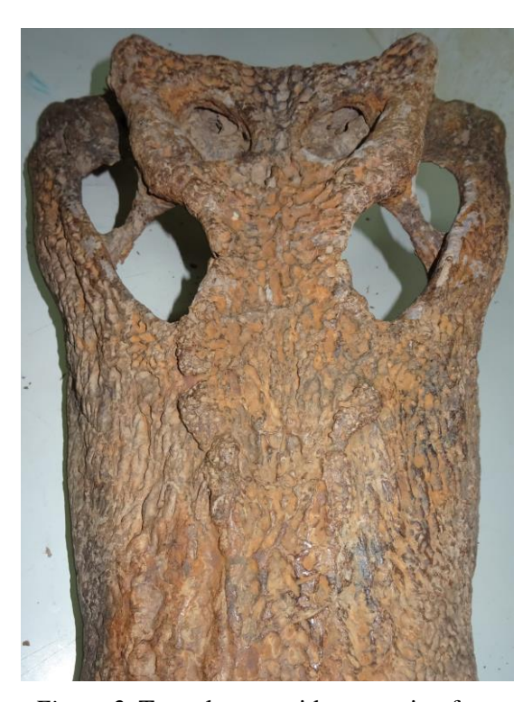
Figure 2. Two elongate ridges running from the orbits down the upper part of the snout are a characteristic of C. porosus and well discernible in Dau Sau, the crocodile skull from Can Tho.

two men" are found. His story continues that in the early years of the 20th century, there was a group of Chà people who were famous for hunting crocodiles. They helped to spear and kill a crocodile "as large as a five-plankboat" - longer than 6 meters - in the Cai Rang River. Therefore, after capturing crocodile, everyone was cheerful, gathered around to divide up the meat. Mr. Ut also reported that up until around 1940 he still saw people butchering crocodiles upstream of the estuary. Crocodile meat was transported from Nam Vang and An Giang to Can Tho by boat (e.g., Can Tho Online 2010). At that point, this area had already been called Dau Sau estuary/Dau Sau channel. In area 1 (An Bình ward nowadays) there is still an ancient temple named ông Vàm Dau Sau [translated as sir Dau Sau estuary; people usually refer to big animals respectfully as ông (which means sir or grandfather)].