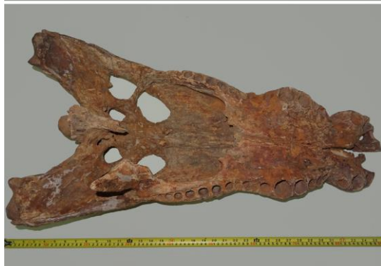
Figure 1. Dau Sau, the crocodile skull from Can Tho, with measuring tape from above (top) and below (bottom).

The man who discovered the crocodile skull did so when he was 86 years old. His family had worked as net fishermen at Dau Sau estuary for generations. His grandfather, who passed away in 1942, and his father, who passed away in 1965, told a story about a remote part of Dau Sau channel where big fish abounds, and where crocodiles "as large as