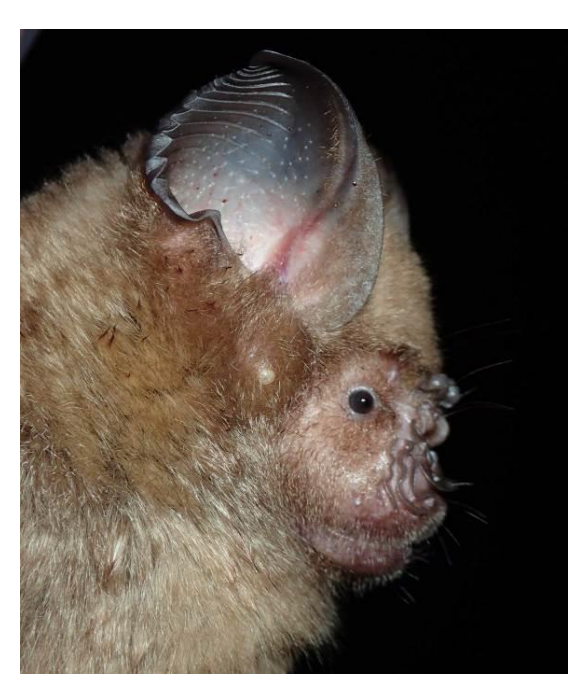
Figure 1. Lateral view of the ear and the face of Hipposideros griffini from lava caves, Dak Nong Province

A total of 12 bats were captured during the survey in Dak Nong Province in April 2019. Of these, seven lactating females were released immediately after careful removal from the harp trap and nets and the residual 5 bats were examined further (table Morphological characteristics and measurements of all captured individuals confirm the identity of Hipposideros griffini (Fig. 1). Their pelage colour is dark brown; the dorsal fur is darker than the ventral. With forearm length of 88.4-91.2 mm (n = 5), all captured individuals of H. griffini are distinguishable from other bat species by body size. Other measurements (EH: 24.2–26.9 mm; EW: 16.6-24.0 mm; TIB: 33.8-37.8 mm; HF: 12.9–14.8 mm) also supported that H. griffini is the largest insectivorous bat species of the study area. Their nose leaves are fleshy and naked with four pairs of supplementary lateral leaflets. The outgrowth and sexual sac behind the posterior leaf of all captured males were well-developed. Together with enlarged pubic nipples of females, these features indicate that Hipposideros griffini in Dak Nong Province is reproductively active in April.