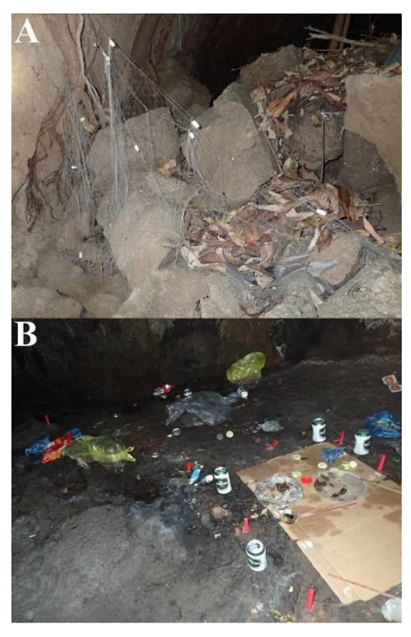
Figure 3. Evidence of hunting and disturbance by tourism activities at lava caves, Dak Nong Province

of the constant frequency component of the second harmonic (CF<sub>2</sub>) are in a range of 76.1–79.7 kHz (Fig. 2). There is no significant difference in CF2 of the calls from different recording situations.