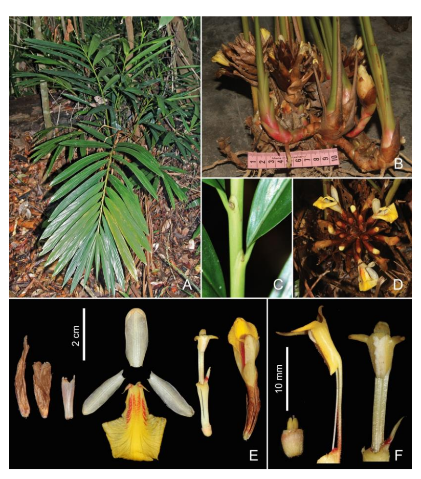
Figure 2. Conamomum odorum. A. Habit. B. Rhizome and inflorescences. C. Ligule. D. Inflorescence. E. Flower dissection. F. Ovary with epigynous glands and anthers (side and front views)

yellow with median red bands at base, reflexed, trilobed; lateral staminode minute, linear, ca. 6 mm long, ca. 1 mm broad at base, acute towards apex, red at base, cream-yellow at apex, with few glandular hairs at base. Filament flat, 13 \times 2.5 mm, yellow, sometimes with red tinge at base, anther yellow, ca. 11.5 \times 4.5 mm (including crest), connective tissue full of glandular hairs; anther crest trilobed, yellow, glabrous, lateral lobes narrow triangular, ca. 6 × 1 mm, pointing downwards, central lobe semi-circular, ca. 3 × 3.5 mm; epigynous glands two, ca. 2 \times 1 mm, yellow; ovary ca. 4 \times 1 3.3 cm, cylindrical, cream, hairy, tri-locular, axile placentation. Stigma cup-shaped, yellow, ostiole ciliate; style ca. 33 mm, cream, sparsely hairy near apex. Fruits not seen (Fig. 2).