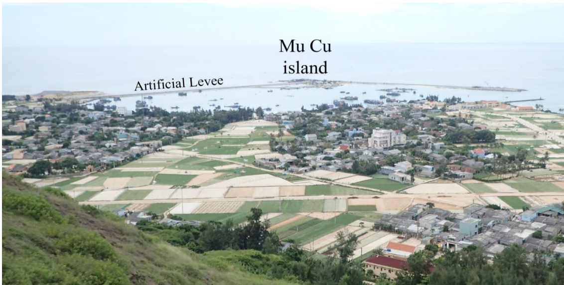
Figure 1. Mu Cu and Cu Lao Re islands of Ly Son have been connected since 2017

attractive destination for tourists since 2007. The development of tourism and agriculture has led to an extraordinary change of natural habitats in the archipelago. Therefore, the remaining natural vegetation within Ly Son has been largely reduced and fragmented. It is remarkable that, prior to 2017, terrestrial plants and animals of the archipelago were unstudied and, as consequence, its vertebrates had never been included in any previous publication. In order to expand knowledge about the bat faunas in Cu Lao Cham and Ly Son, we conducted a series of field surveys for an assessment of their diversity and conservation status. This paper provides information of the bat species recently recorded over the recent surveys.