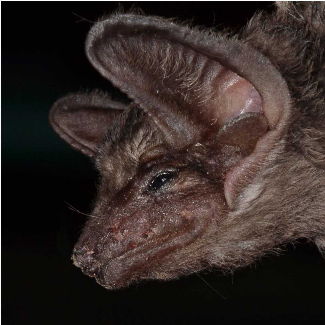
Figure 2. Lateral view of Taphozous melanopogon from Cu Lao Cham

The individuals were captured by Hoang Quoc Huy without equipment for sound recording. A recent study of emballonurid bats including this species indicated that echolocation calls of Taphozous melanopogon from offshore habitats are different in comparison with those of the mainland populations (Thong et al., unpublished data). Therefore, echolocation calls of the Cu Lao Cham population must be investigated for an acoustic assessment through its distributional range.