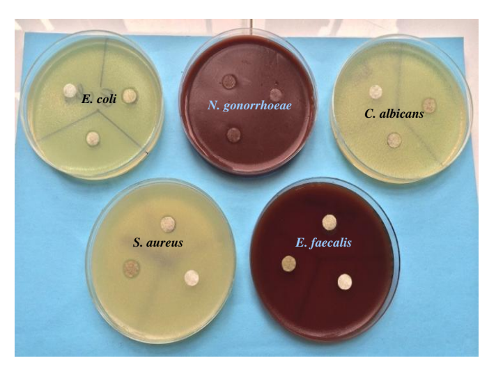
Figure 3 . Antibacterial rings of 3 nanosilver-impregnated fabric pieces with respect to the bacteria in the excretion track.

Table 2. Antibacterial activity of AgNPs-impregnated non-woven fabric against the bacteria spp. in the exudative track depending on nanosilver content.