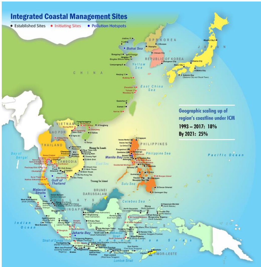
Figure 1. ICZM sites in East Asia and Southeast Asia related to PEMSEA programme [15]

governments did not accept the existing ICZM programme [14]. In addition, ICZM needs to concern interests and the participation of the community, but in many cases, this involvement is formal and brings movement meaning, not natural.