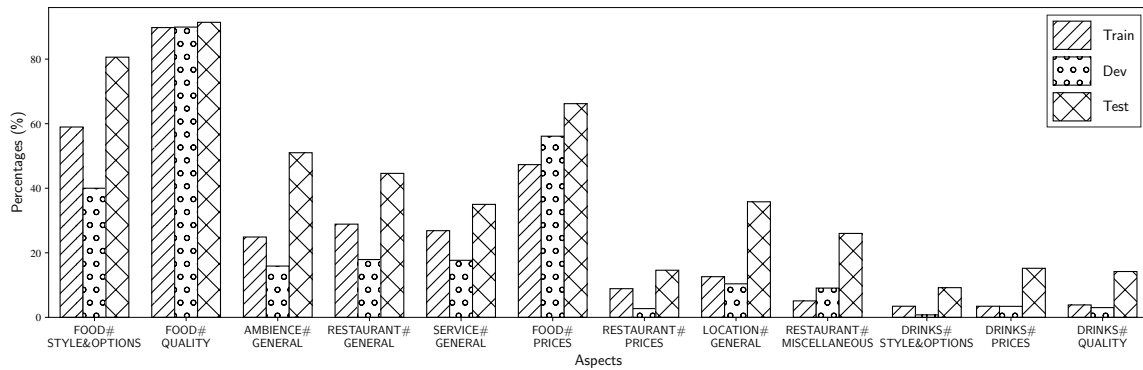
Figure 2. Statistics the percentage of number of reviews of each aspect on three datasets: train, development, test..We calculate the percentage of reviews that are labeled aspect over the total number of reviews for each dataset