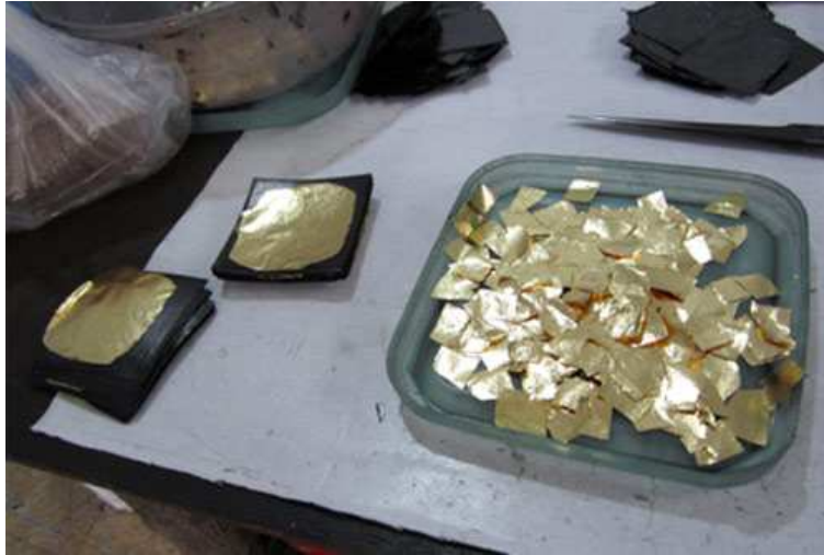
Fig. 1. The thin gold leaves fabricated by the traditional laminating technology.

higher frequency in the low temperature [3]. In this paper, we discuss the electrical and optical properties of the thin gold leaves manufactured by the traditional Vietnam hand-made technology, and received from in the Kieu Ki village. The thin gold leaves has an average surface area of 3 \times 3 cm (Fig. 1), an average mass of 0.00263g. The measured density was 18.88 \text{ g/cm}^3 , same as reported in Ref. [1], so the average thickness of the leaves was determined to be 200 nm.