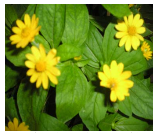
Part of the plant Wedelia urticaefolia

A review on the chemical constituents of the