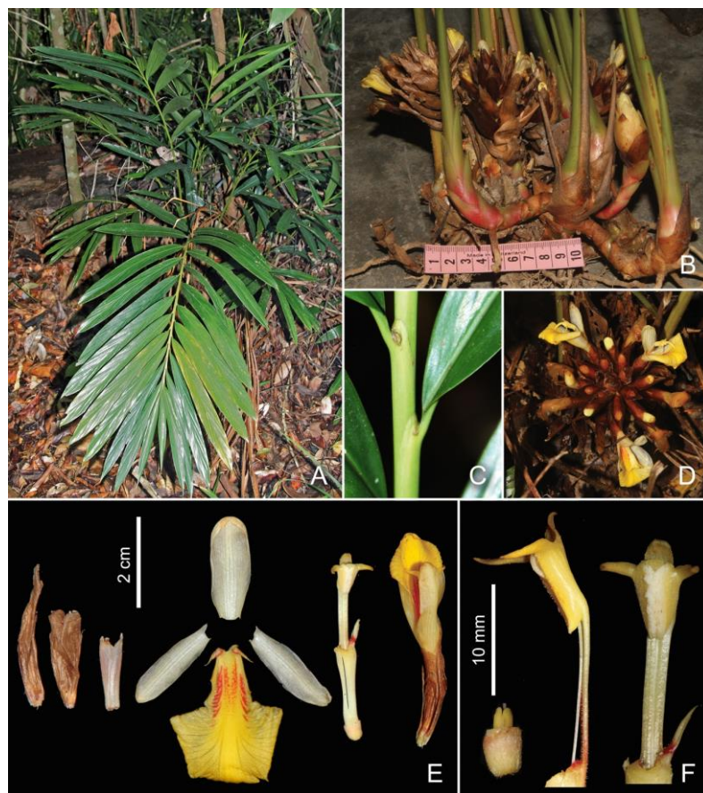
Figure 2. Conamomum odorum . A. Habit. B. Rhizome and inflorescences. C. Ligule. D. Inflorescence. E. Flower dissection. F. Ovary with epigynous glands and anthers (side and front views)

yellow with median red bands at base, reflexed, trilobed; lateral staminode minute, linear, ca. 6 mm long, ca. 1 mm broad at base, acute towards apex, red at base, cream-yellow at apex, with few glandular hairs at base. Filament flat, 13 × 2.5 mm, yellow, sometimes with red tinge at base, anther yellow, ca. 11.5 × 4.5 mm (including crest), connective tissue full of glandular hairs; anther crest trilobed, yellow, glabrous, lateral lobes narrow triangular, ca. 6 × 1 mm, pointing downwards, central lobe semi-circular, ca. 3 × 3.5 mm; epigynous glands two, ca. 2 × 1 mm, yellow; ovary ca. 4 × 3.3 cm, cylindrical, cream, hairy, tri-locular, axile placentation. Stigma cup-shaped, yellow, ostiole ciliate; style ca. 33 mm, cream, sparsely hairy near apex. Fruits not seen (Fig. 2).