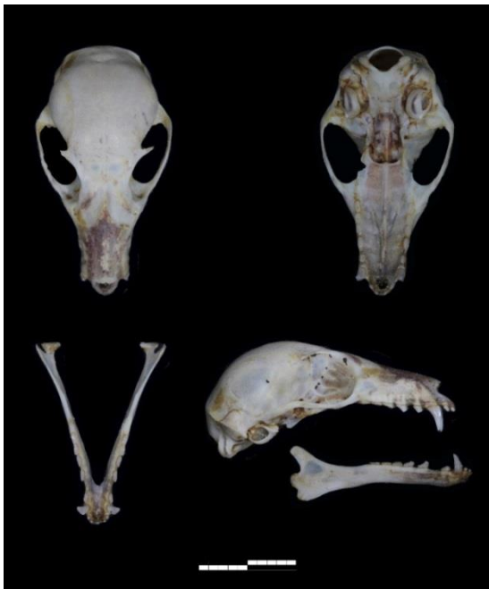
Figure 3. Dorsal, ventral, and lateral (from top-left clockwise) views of the skull and mandible of M. minimus from Vietnam. Scale = 10 mm

narrow. There are eight palatal ridges on the palatal surface. The mandible is long and thin, with low processes. Symphysis keel of lower jaw is obsolescent. In lateral view, it has a slopping outline (Fig. 3). The upper tooth rows length of an average 8.2 mm (8.0–8.4), the lower tooth rows length of an average 9.4 mm (9.2–9.6) (Table 1). The canines are rather short and sharp. Upper tooth rows have two molars, lower tooth rows have three molars.