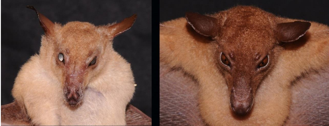
Figure. 1. Frontal view of M. minimus (left) and M. sobrinus (right) from Vietnam (not to scale)

rather short and sharp. Upper tooth rows have two molars, lower tooth rows have three to four molars.