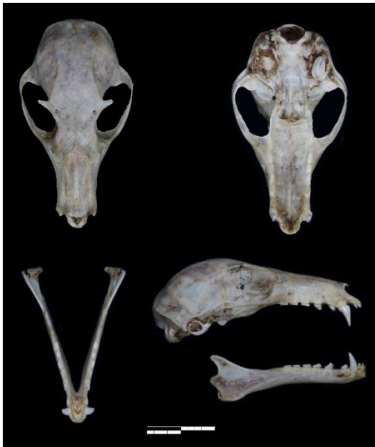
Figure. 2. Dorsal, ventral, and lateral (from top-left clockwise) views of the skull and mandible of M. sobrinus from Vietnam. Scale = 10 mm