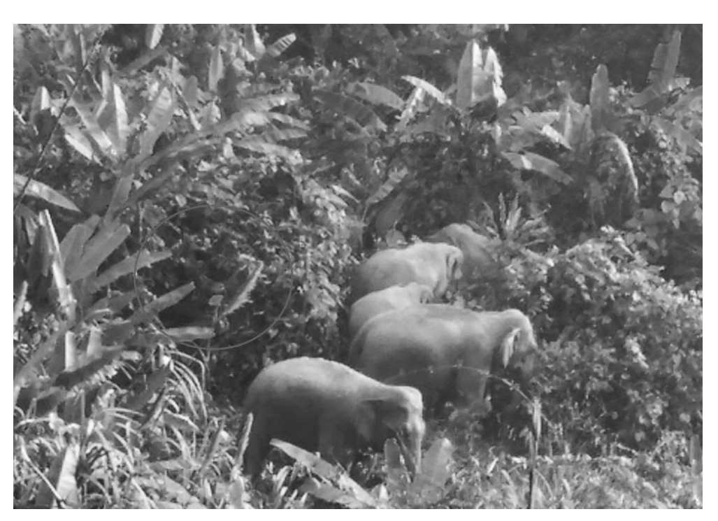
Figure 3 .A part of Anh Son elephant group. Picture taken in 13 February 2018

Our survey in 2019 has obtained important information about Anh Son elephant group. Results from interviewing local residents and forest rangers showed that this elephant group consisted of 7-8 individuals including 1 subadult male and a baby of about 2 years old. We consulted videoclips taken by a worker on 23rd of May 2015, in the Twelfth September Rubber Plantation Enterprise and pictures taken by a local resident in 13th of February 2018 at Suc stream area near the Cao Veu 1 villager (Figure 3). The videoclips recorded 5 individuals including 3 adult females, 1 young male of about 3-4 years old and 1 juvenile of un-known sex. While the pictures recorded 6 individuals including 5 adult females and 1 young of about 4-5 years old. Although both videoclips and pictures did not record adult male, local residents reported of an adult male with tusks 30-40 cm long. Local residents also reported of a female giving birth in October 2016, in Met plantation of Mr. Nguyen Ngoc Dong household (Cao Veu 1 village, Phuc Son commune). After the birth, the mother and her baby stayed in the Met plantation for several