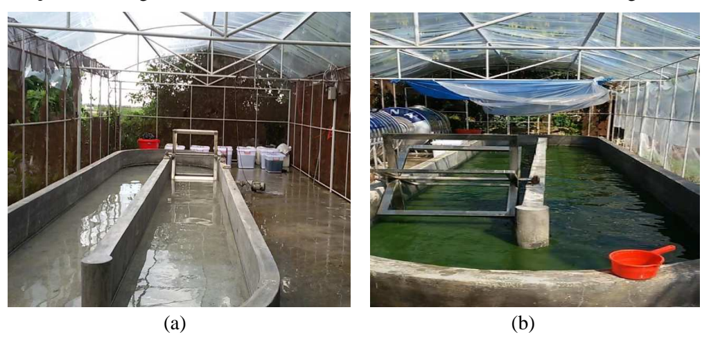
Figure 3. The raceway tank before (a) and during algal cultivation (b).

The OD was measured every three days in order to evaluate the growth and productivity of Spirulina platensis . Figure 4 illustrates the results of OD taken at 445 nm wavelength.